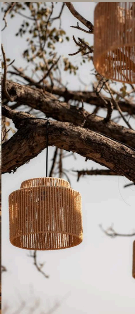
Riverbed ceremony area walking distance from wedding venue